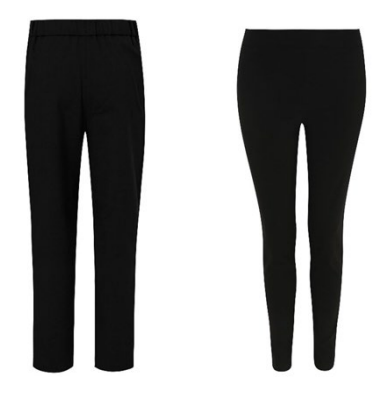
Acceptable Not Acceptable

Trousers should be full length tailored trousers. They can be found at most uniform suppliers. Skin tight trousers are not permissible. Consider the following image: