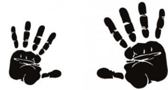
Parent Child Relationships